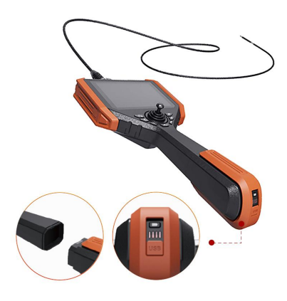
Combined battery, easy to disassemble