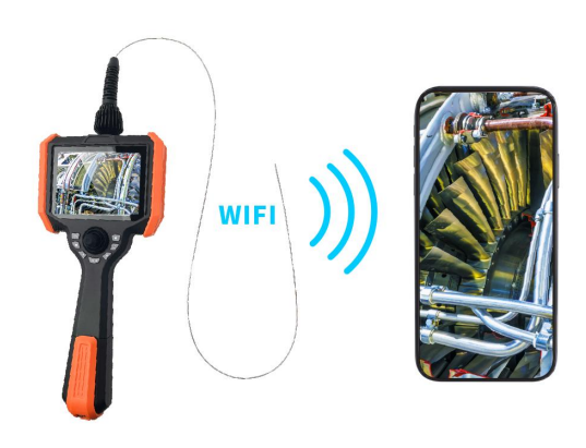
WIFI wireless transmission (for optional)