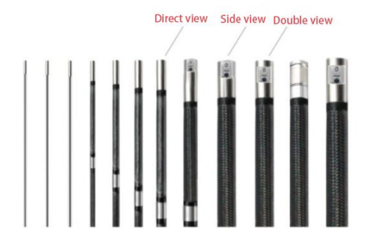
More probes for optional