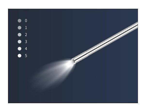
Front LED highlight light, sufficient light source

VS-GK series is equipped with a number of detection functions, with advanced technology , and comprehensive functions , which assists the inspectors to complete the inspection work efficiently.