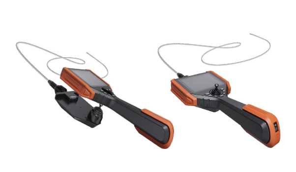
Quick to change probes