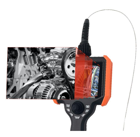
5 inch screen, more convenient to watch