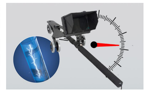
6 hours extra long endurance