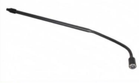
HD Hose Camera