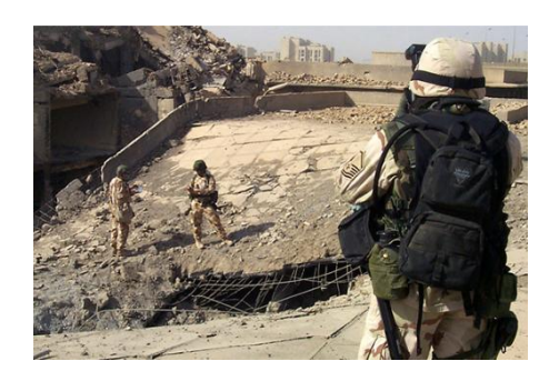
Dangerous search and rescue