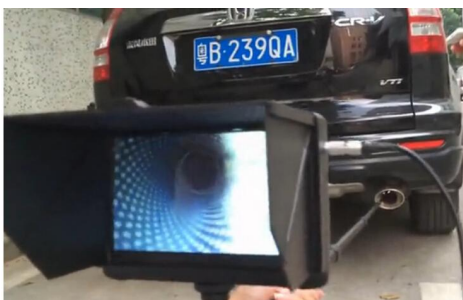
19.5mm mini camera to detect narrow gaps

360-degree inspection, no leakage, real-time shooting of high-definition video or pictures, providing inspectors with convenient, fast and professional visual inspection.