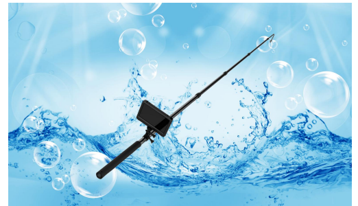
Waterproof grade IP68