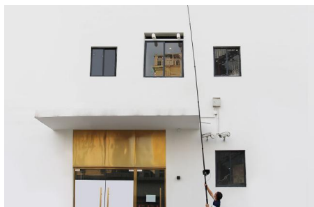
5 meters telescopic