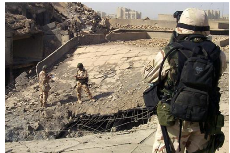
Dangerous Search and Rescue