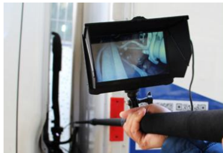
5 million camera pixels Take pictures as an iPhone