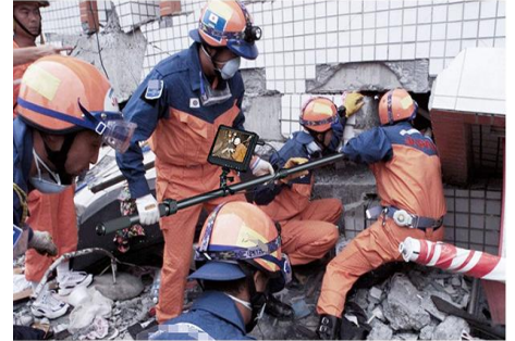
Dangerous Search and Rescue