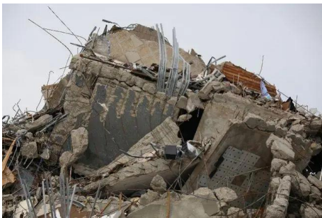
Emergency failure investigation