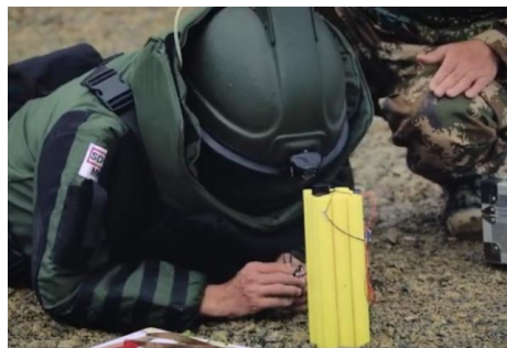
Counter terrorism eod