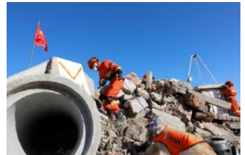
Coordinated rescue search