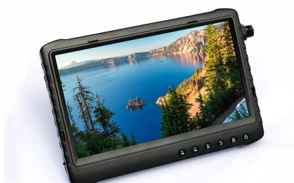
7 inch HD large screen