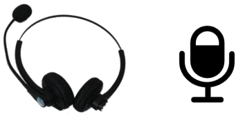
Two way intercom Monitor