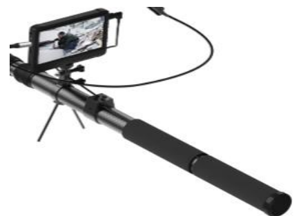
Telescopic probe rod