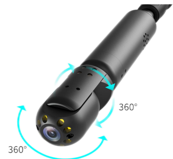
360° full swing head